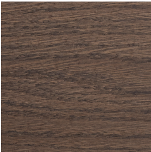
Walnut Stained Oak