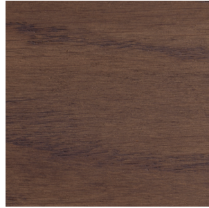
Ash Grey Oak