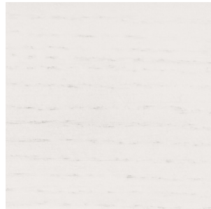
Walnut Stained Oak